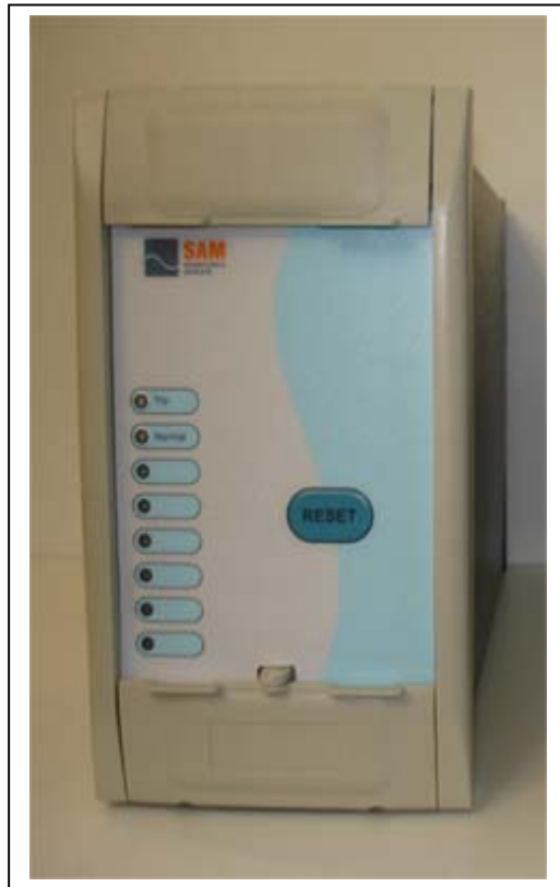
SAM ETCA43 Trip circuit supervision Relay